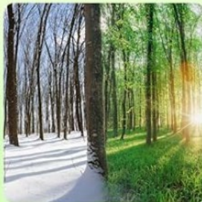
USDA Zones 3-10