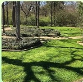
Full Sun To Part Shade